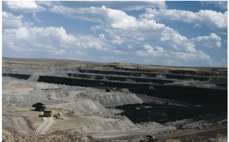
Numerous mines, both open pit and underground operations, have used BHGE to support their dewatering efforts.