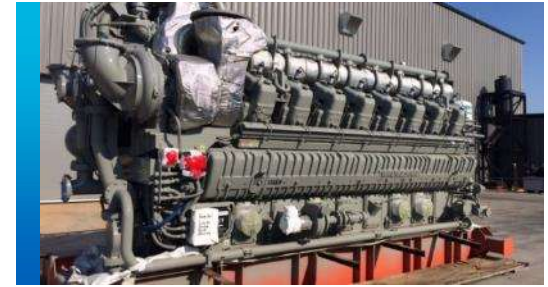
Qty (4) Waukesha 16V275GL+ As-Is $1,100,000/unit