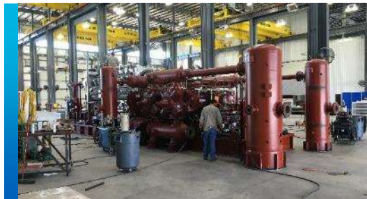
Qty (4) WH76/Waukesha 16V275GL+ As-Is $3,000,000