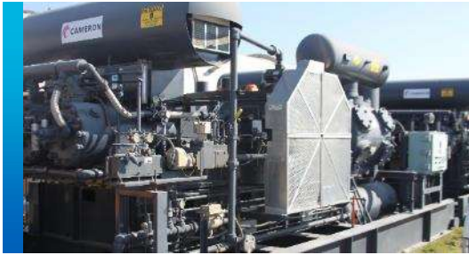
Qty (6) DPC -2803 Non LE As-Is $400,000/unit

All equipment is new. Full 12/18 month new equipment warranty for functionality