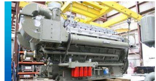
Superior 16SGTD - $749,500 Superior 12SGTD - $549,500