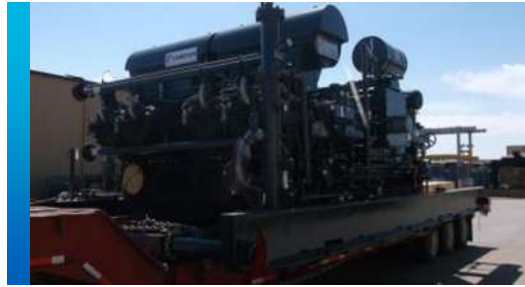
Qty (3) DPC -2804 Non LE As-Is $535,000/unit