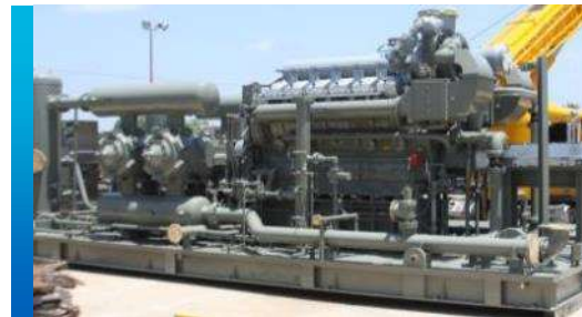
Qty (1) MH64/Superior 12SGTD As-Is $1,500,000