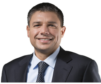
LORENZO SIMONELLI President & CEO

Combining skills and expertise from GE Oil & Gas and Baker Hughes to form an industry-leading team driving global impact